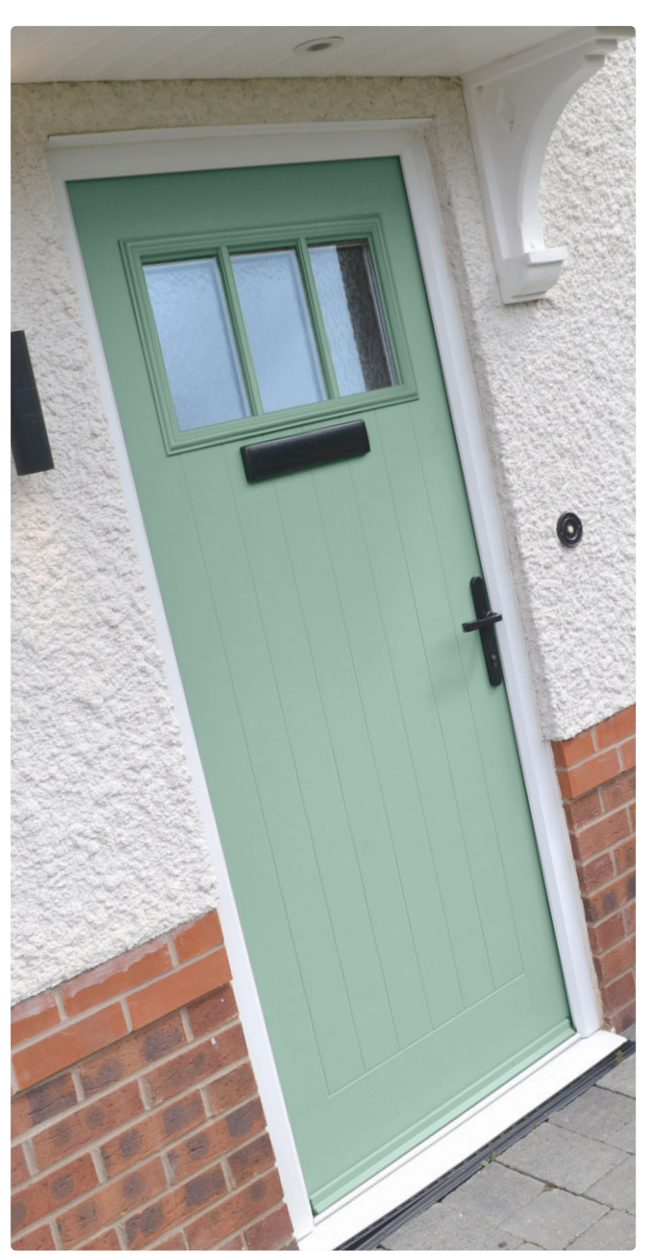
If a spy hole is chosen, it will be sent `supply only' for you to drill and install. This could void your guarantee.