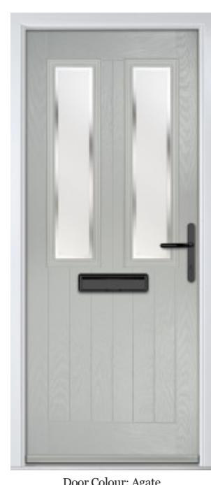
Door Colour: Agate Door Glass: Etch Border