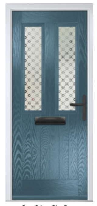
Door Colour: Blue Green Door Glass: Fleur

The epitome of modern heritage, the Lincoln takes inspiration from the historic city itself, combining a timeless design with two long pains of glass giving this popular design a farmhouse twist.