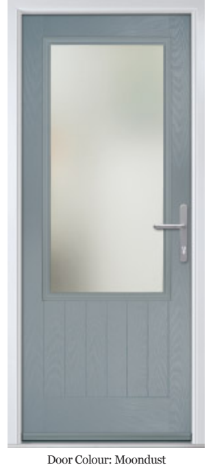
Door Colour: Moondust Door Glass: Satin