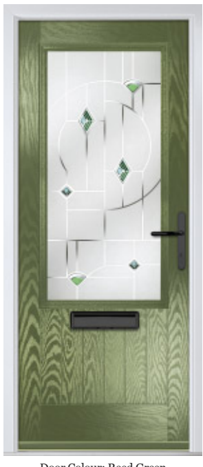
Door Colour: Reed Green Door Glass: Murano Green