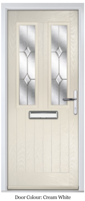
Door Glass: Diamond Classic