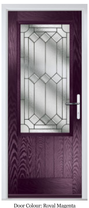
Door Glass: Simplicity Zinc