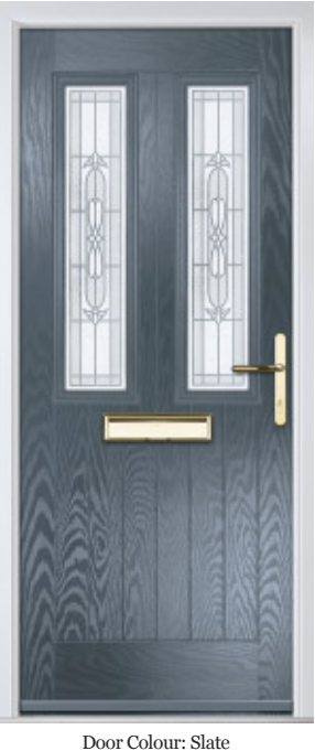
Door Glass: Etch Splendour