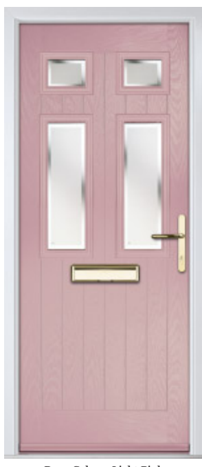
Door Colour: Light Pink Door Glass: Etch Border