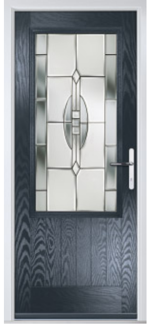
Door Colour: Anthracite Door Glass: Reflections

Showcasing all the personality of the market town itself, the Stafford puts glass at the forefront with a large pane of glass. Finished to perfection with traditional farmhouse grooves, this door aims to make a statement.