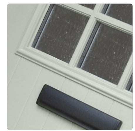
If a spy hole is chosen, it will be sent 'supply only' for you to drill and install. This could void your guarantee.