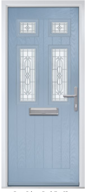
Door Colour: Duck Egg Blue Door Glass: Silvaner