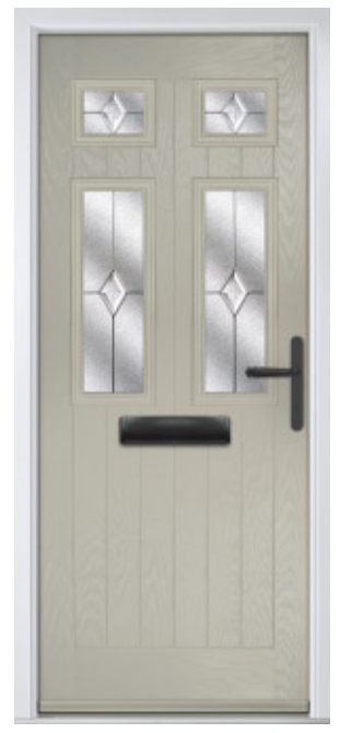
Door Colour: Pebble Grey Door Glass: Diamond Classic

Taking inspiration from all corners of the county, the Cumbria comprises traditional farmhouse grooving with a nod to the countryside of the Scottish borders while the 4 panes of glass allow personality to be added.