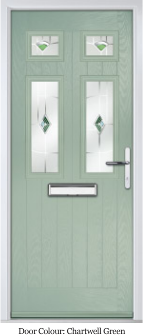
Door Glass: Murano Green